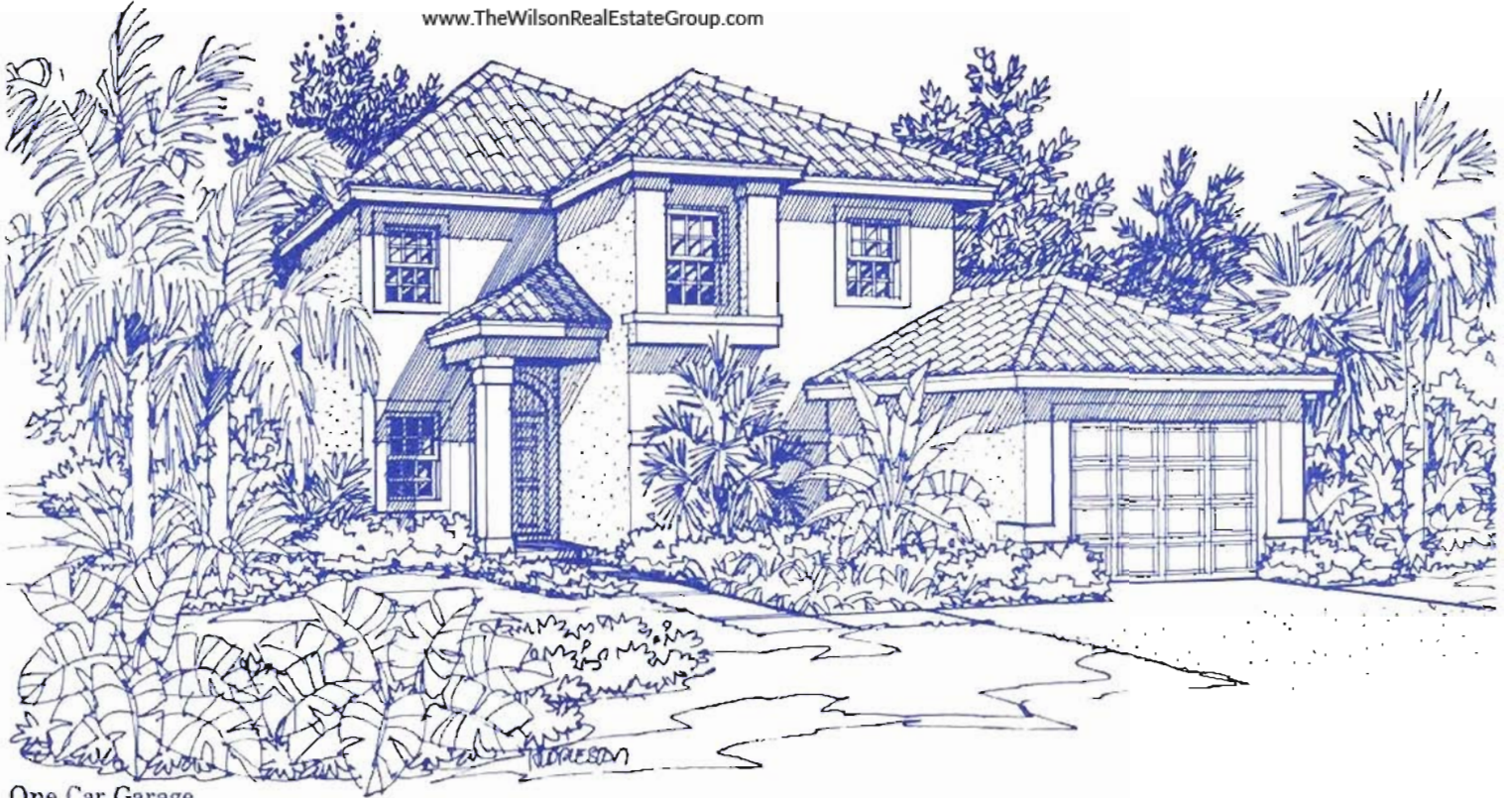
One Car Garage