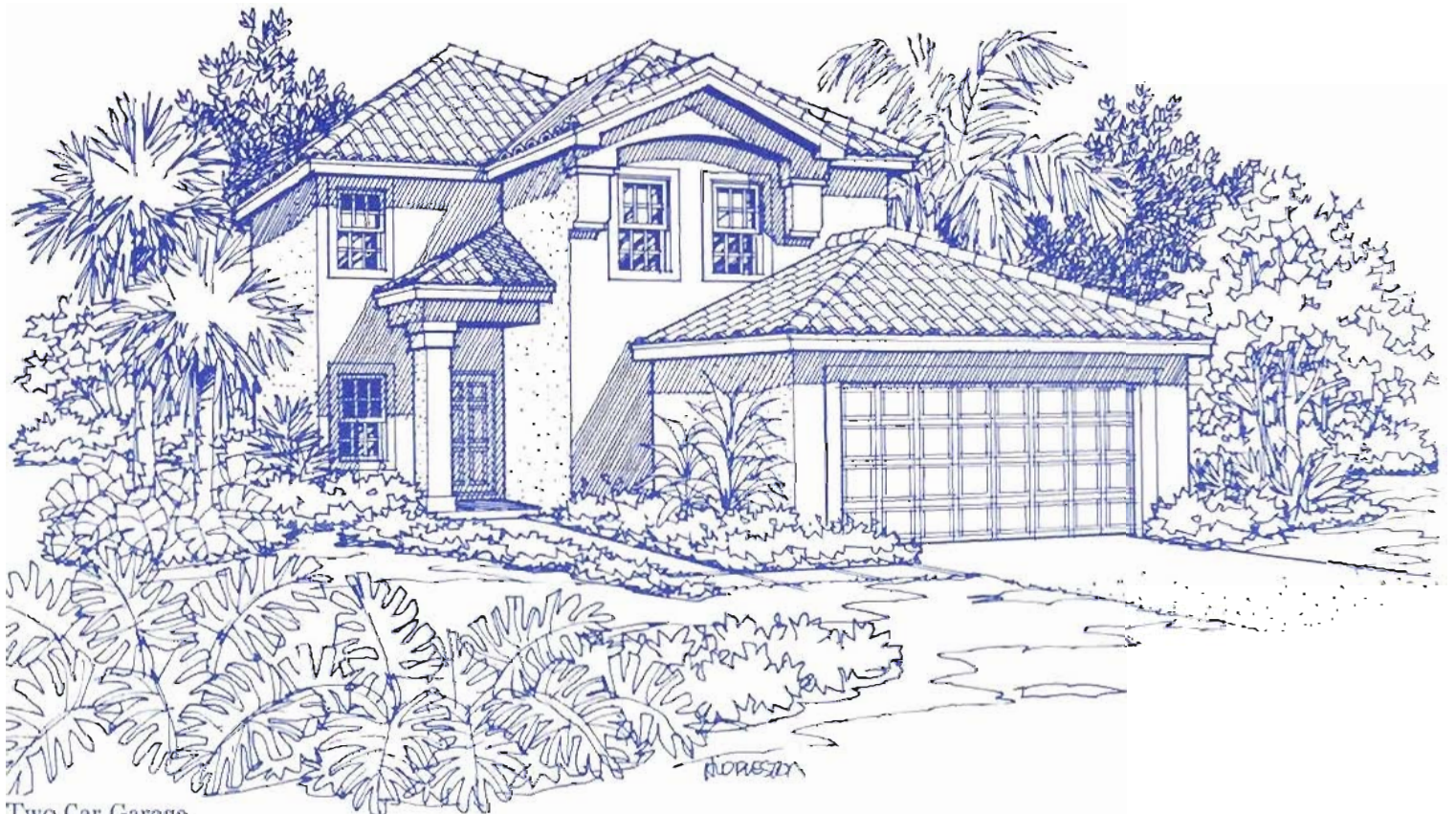
Two Car Garage