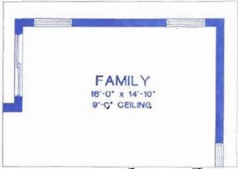
FAMILY ROOM OPTION

Prices, plans, specifications, dimensions, materials, and availability subject to change without notice. Floorplans not to scale and may be reverse (mirror image) of those shown. Landscaping depicted not to scale and may vary as to maturity and number.