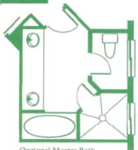
Optional Master Bath

All dimensions are approximate. Builder reserves the right to make changes deemed necessary or advisable by the architect, developer or appropriate governmental agencies.