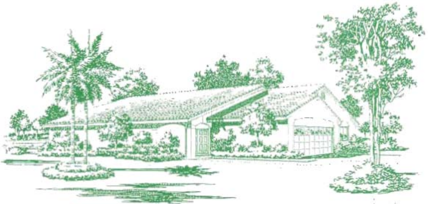
Dominica 3 Gable Elevation

954-818-6092 TroyWilson@kw.com www.TheWilsonRealEstateGroup.com