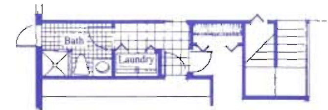
Alternate Bath Access