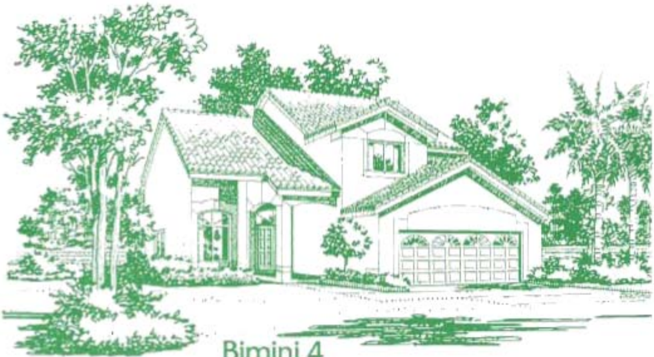
Bimini 4 Gable Elevation