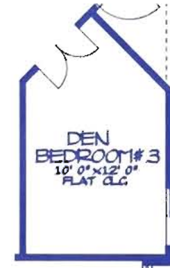
OPTIONAL DEN ENTRY