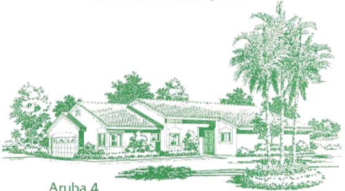
Aruba 4 Gable Elevation